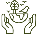
PROTECTION OF BIODIVERSITY