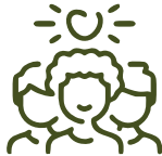
EQUITY, STAFF AND LOCAL ECONOMY