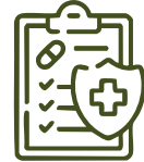
HEALTH AND SAFETY